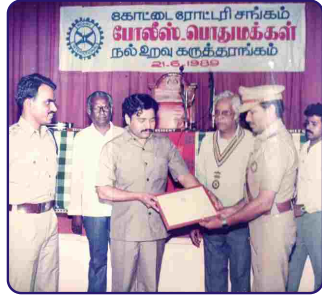
For a Sake of Honor Award