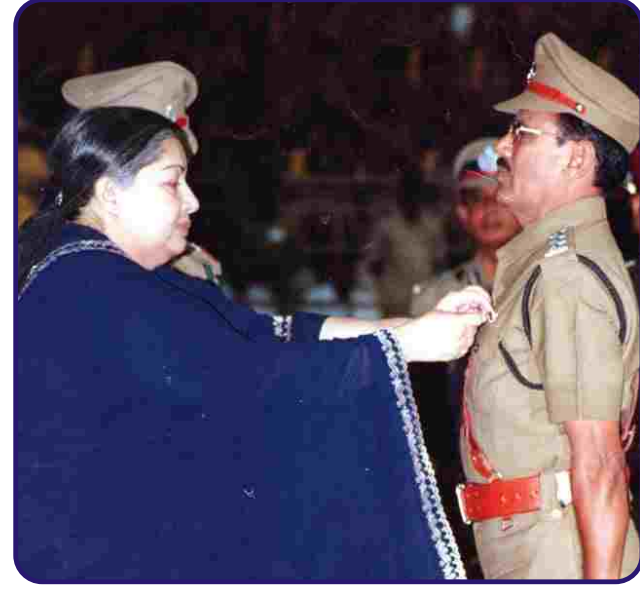
President Police Gallantry Medal