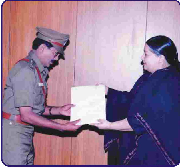
For Exemplary Service