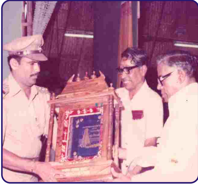
For Outstanding Service